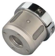
REPRESENTATIVE PICTURE ACTUAL OPTIONS MAY VARY