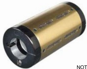
REPRESENTATIVE PICTURE ACTUAL OPTIONS MAY VARY